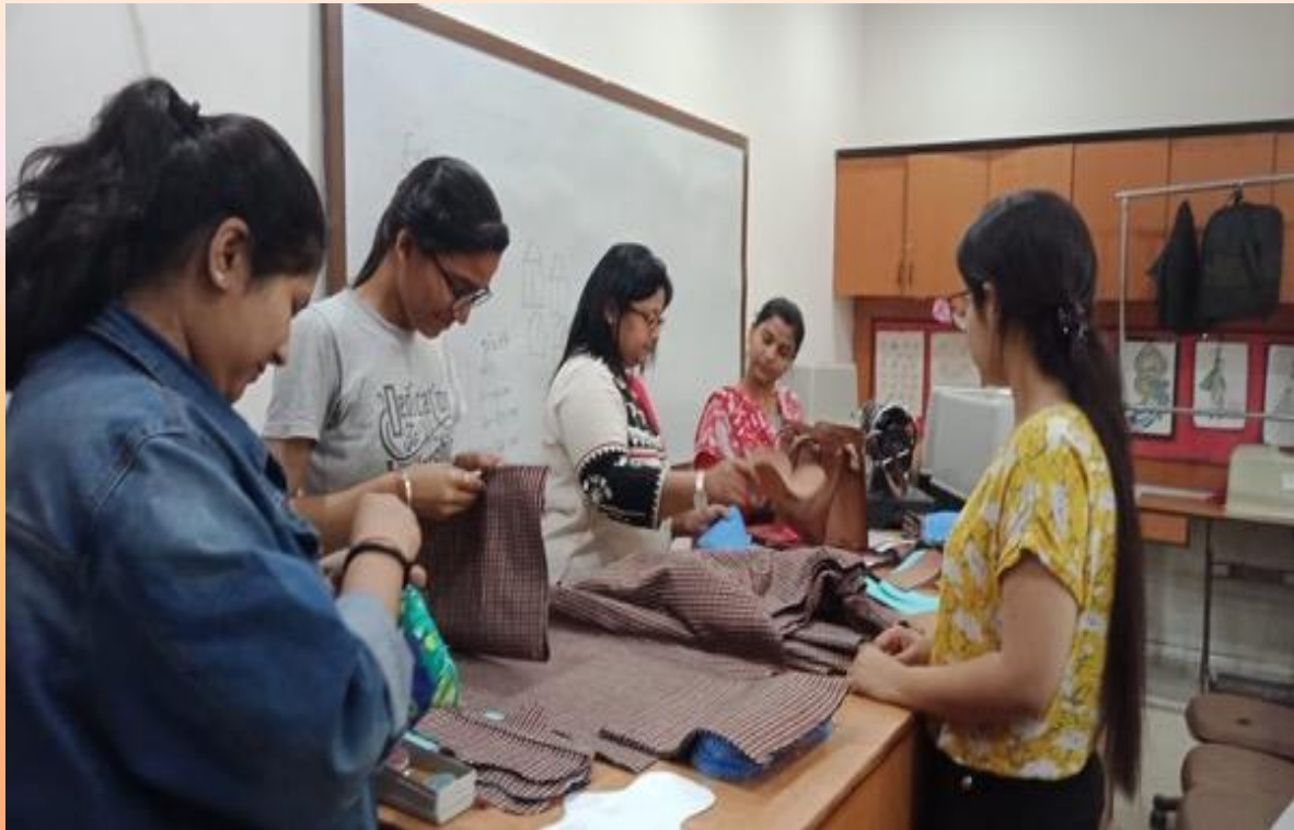
Students being trained on the Pattern cutting for Reusable Ecologically Sustainable Fabric Mask