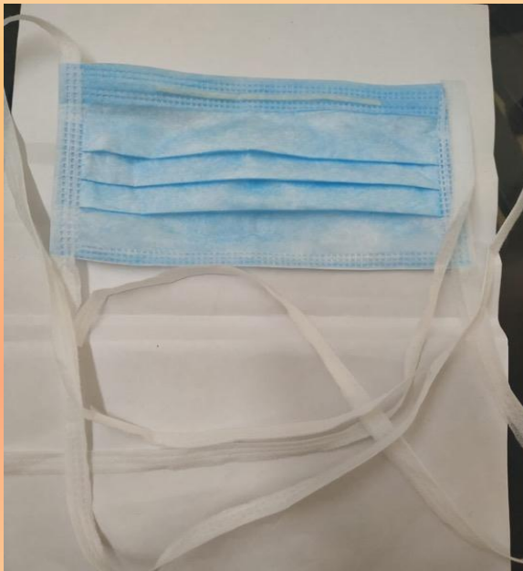
Reference Mask used for sample development

A group of five students and faculty leveraged the pattern developed for face-masks.