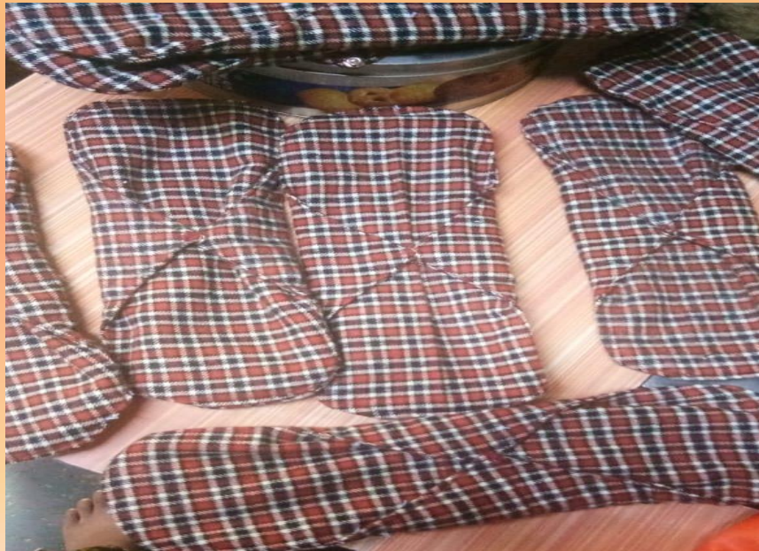
Re-usable Sanitary Napkins given for Pilot Testing

As per feedback received the developed reusable sanitary napkins were good in fit, easy to use, fair in absorbency.