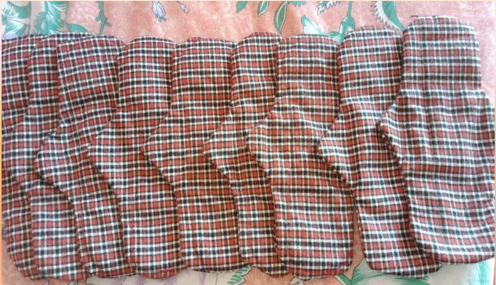
Re-usable Sanitary Napkins developed for Pilot Testing