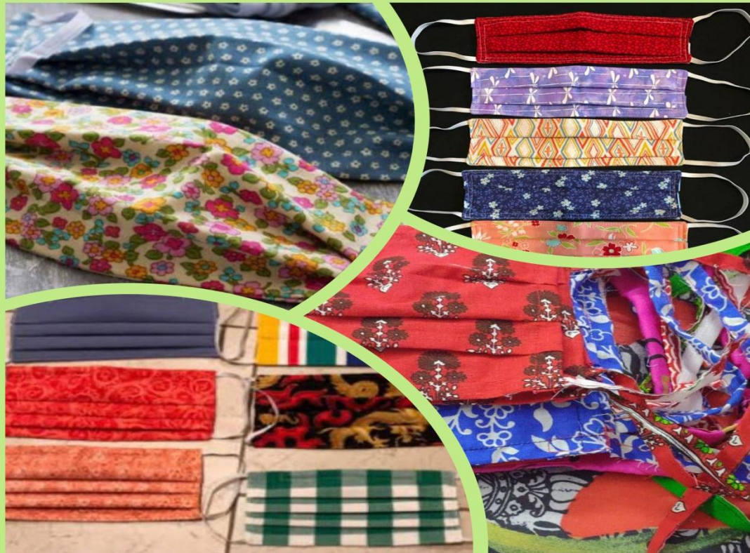
Samples: Reusable Ecologically Sustainable Fabric Mask

20 Face masks were prepared as a part of pilot study. Testing was conducted following this and necessary pattern alterations were made for better comfort and fitting.