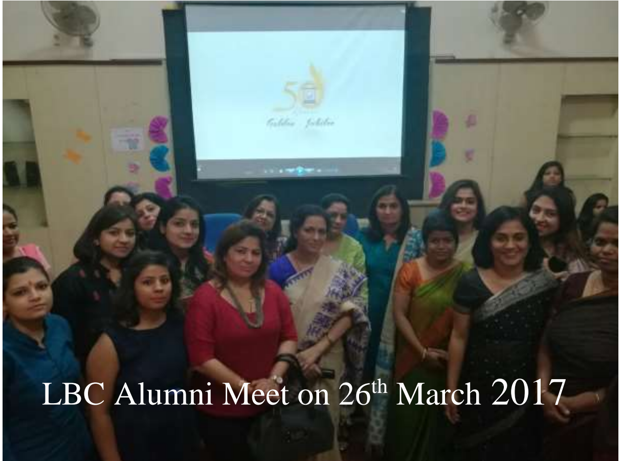
LBC Alumni Meet on 26 th March 2017