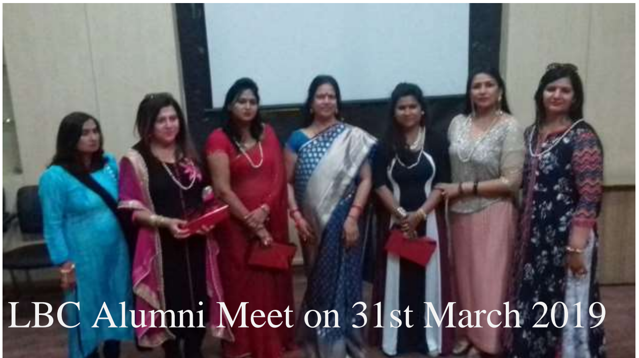
LBC Alumni Meet on 31st March 2019