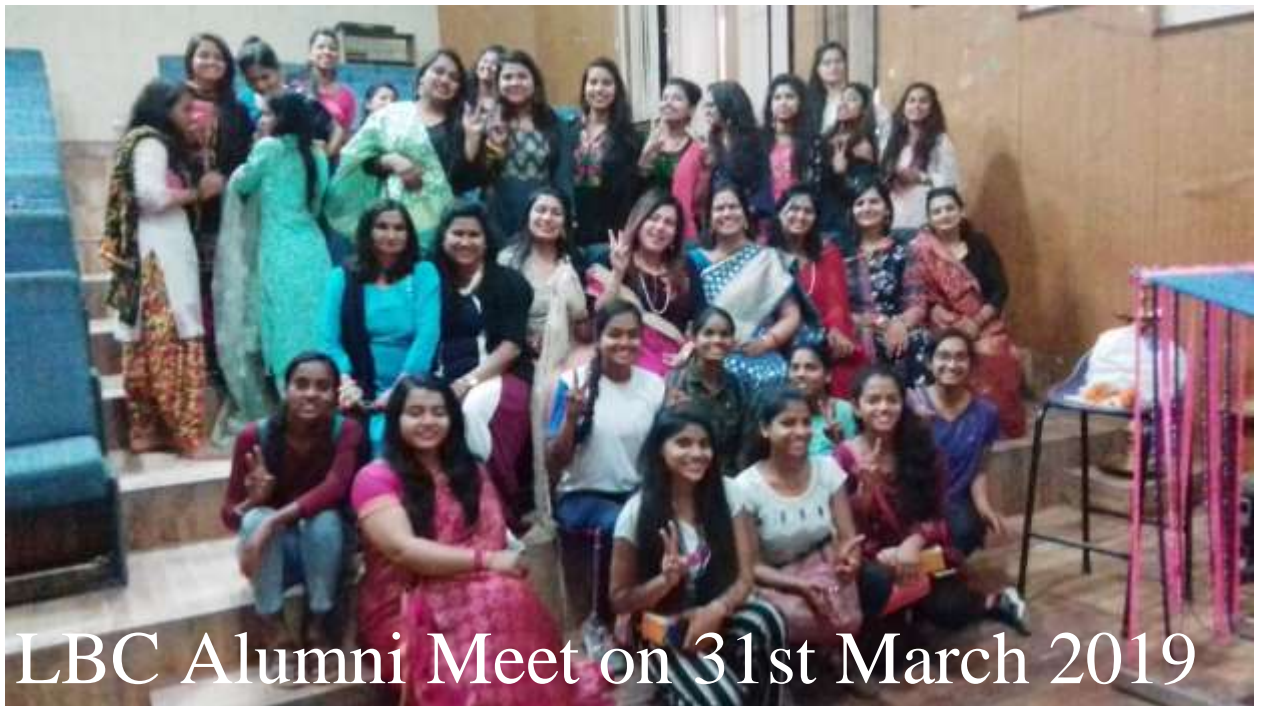
LBC Alumni Meet on 31st March 2019