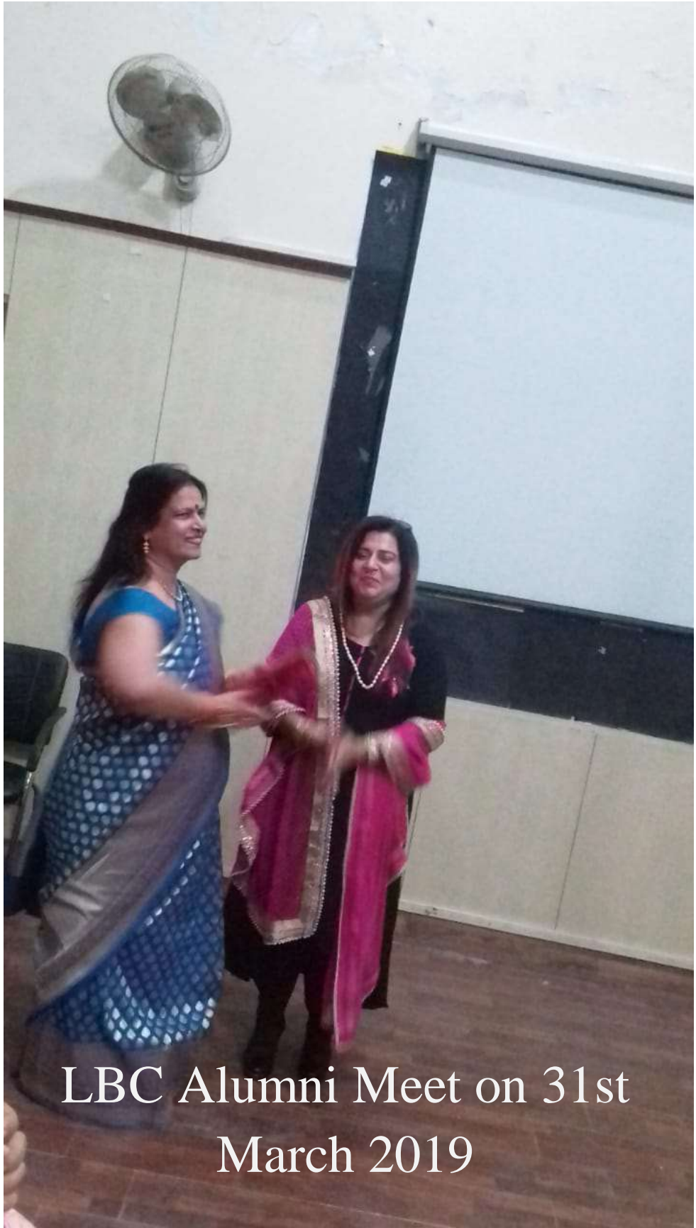
LBC Alumni Meet on 31st March 2019